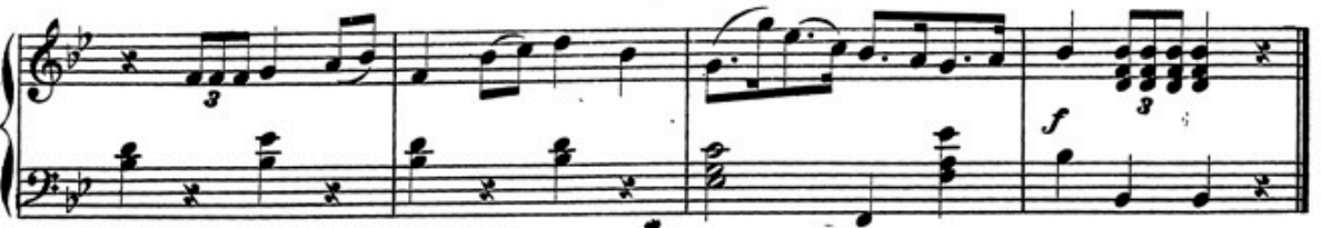
Pleasure and Profit, No.V.