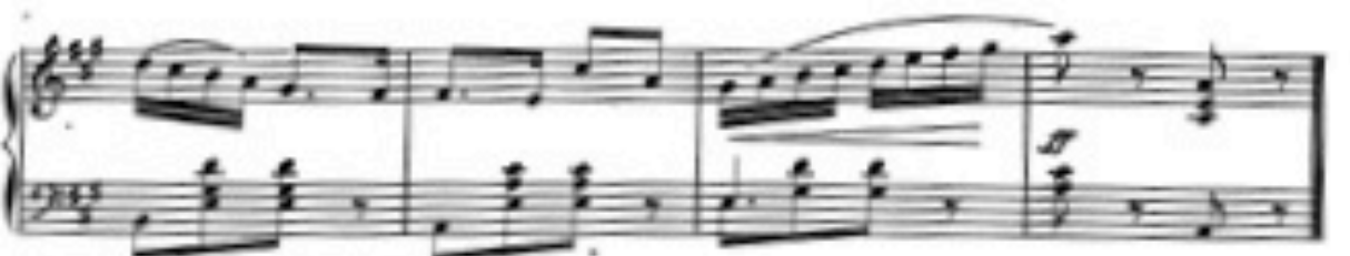
Pleasure and Profit No. II.