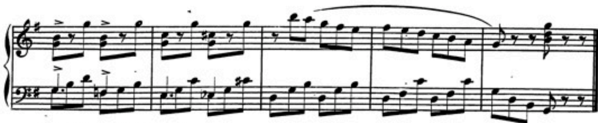
Pleasure and Profit No. III.