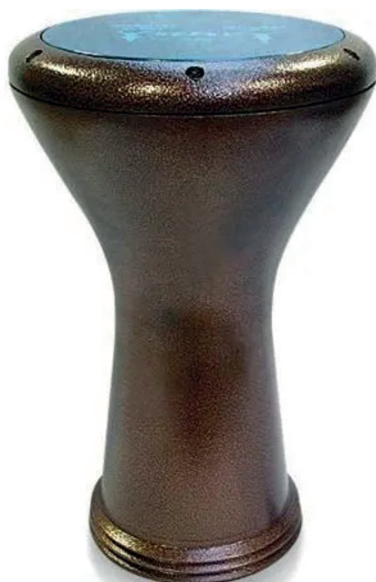
THE DERBOUKA (PERCUSSION)