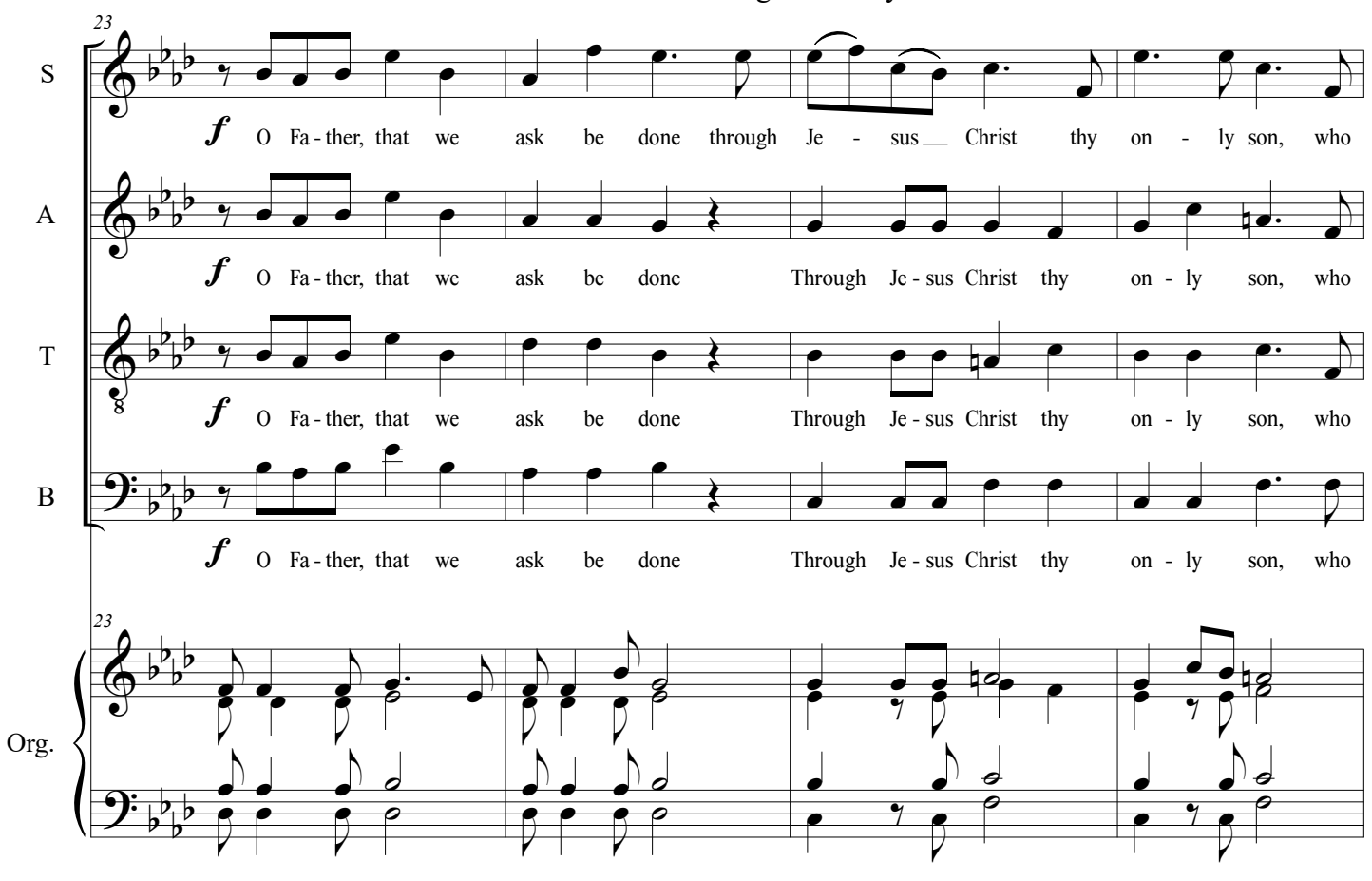
Before the ending of the day