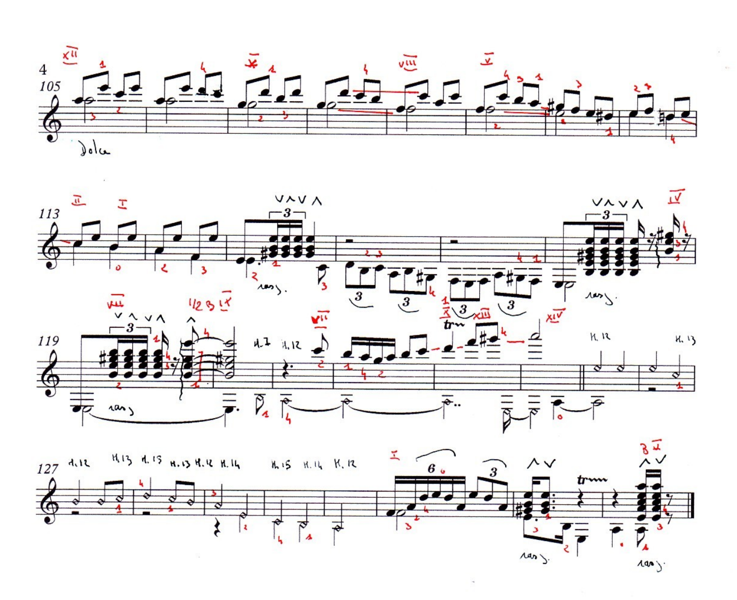
Pièce baré son des forgments d'aires tirés du folklore espagnol