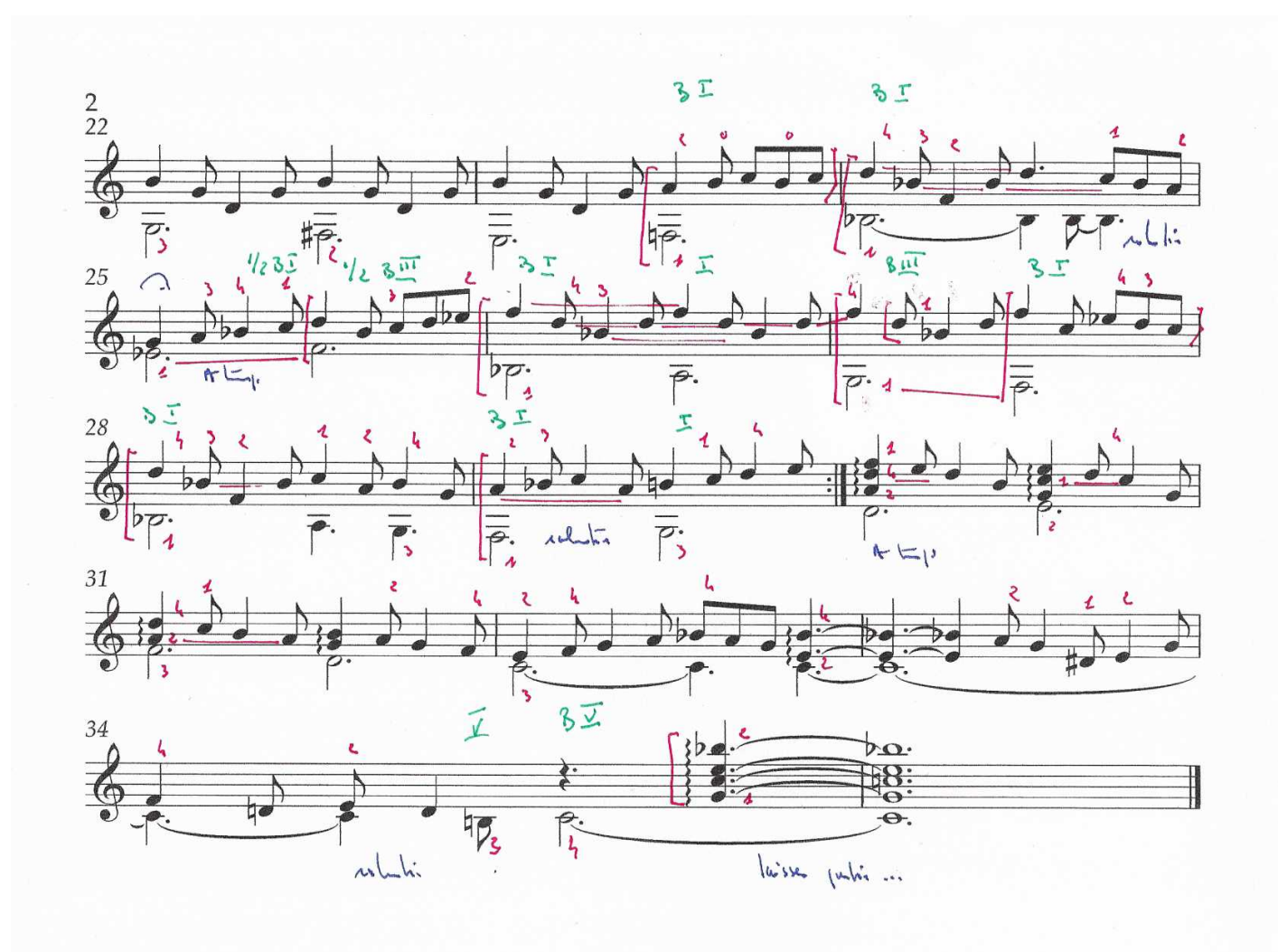
Pièce n° 2153 : "Un Classico-Bluesv-Rock-Pop Time assez particulier" - p02 -