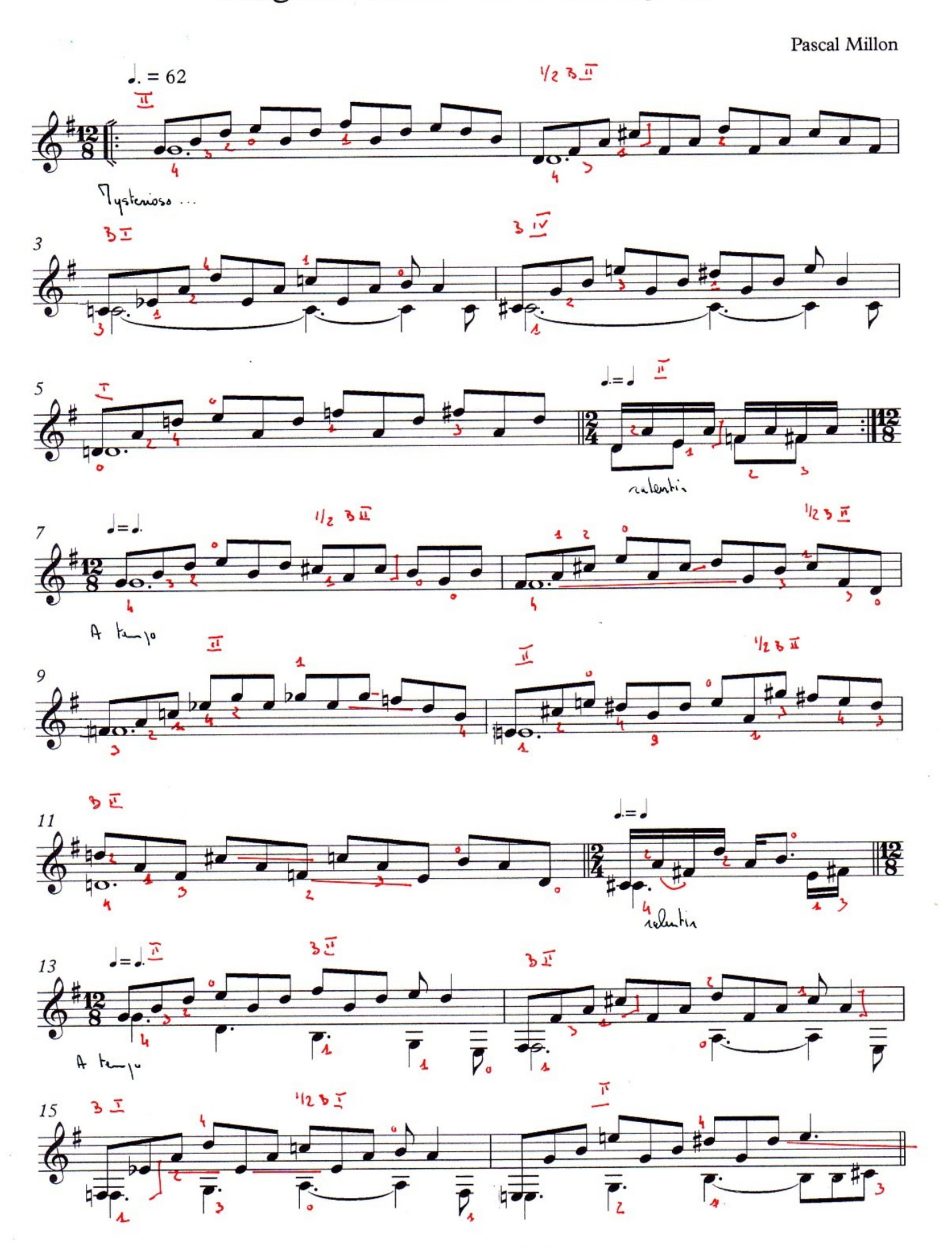
Gergy, 1979 - Musicalités - Sacem free-scores.com