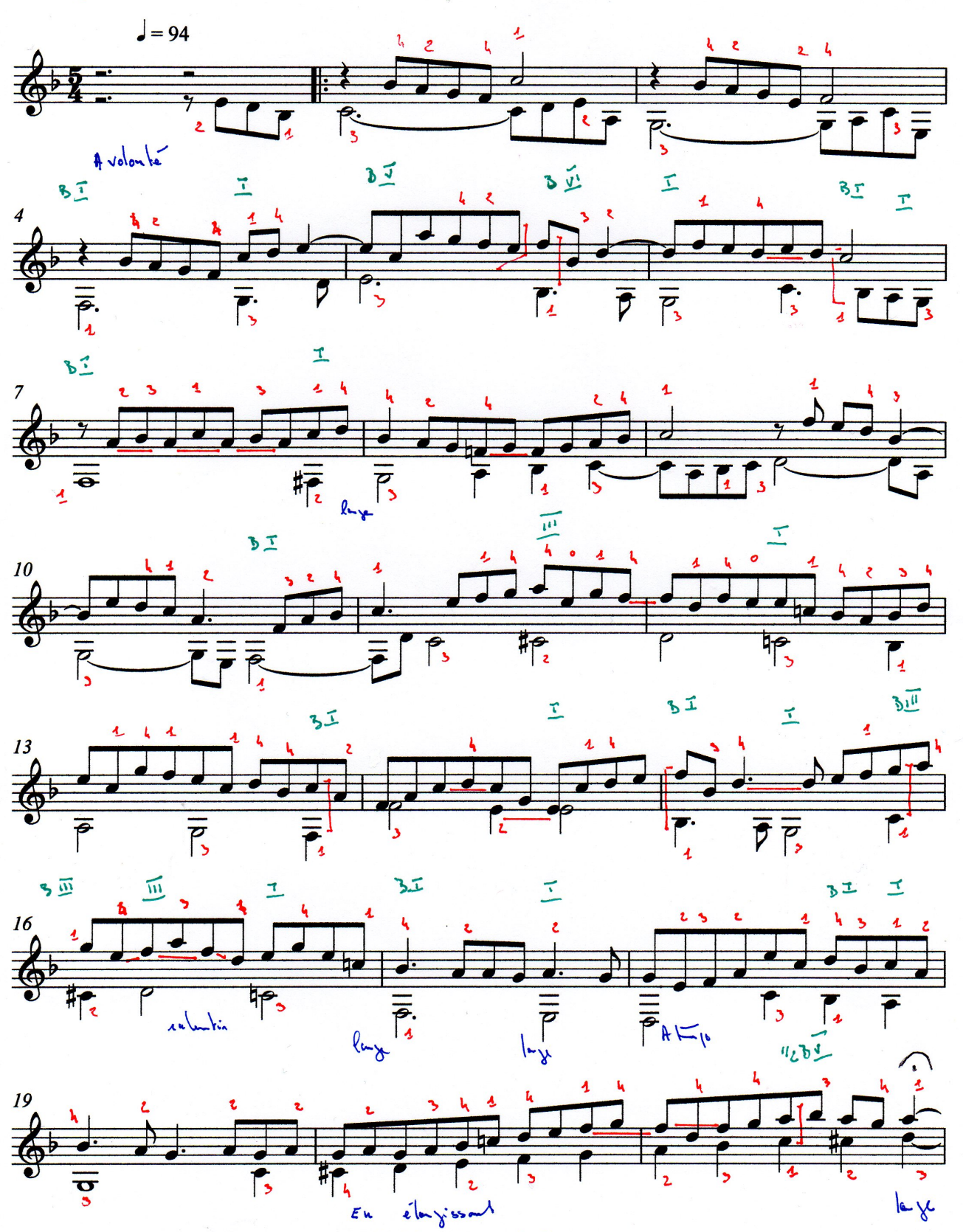
Muscadie, juin 2020 - Musicalités - Sacem