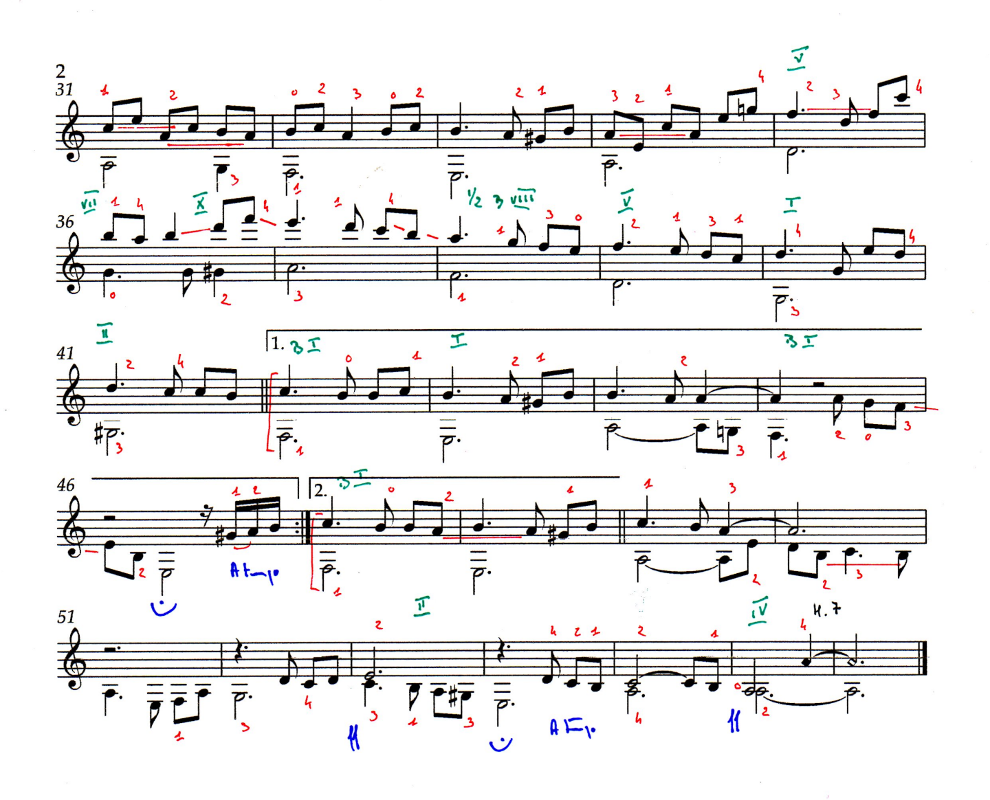
Pièce n° 1666 : "Grosse remontée d'amertume" - p 02 -