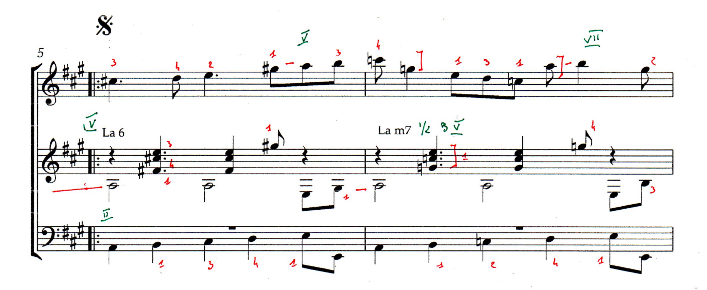
Chalon/Saône, 1984 (argt en trio à Salins les Bains en 2010) - Musicalités - Sacem