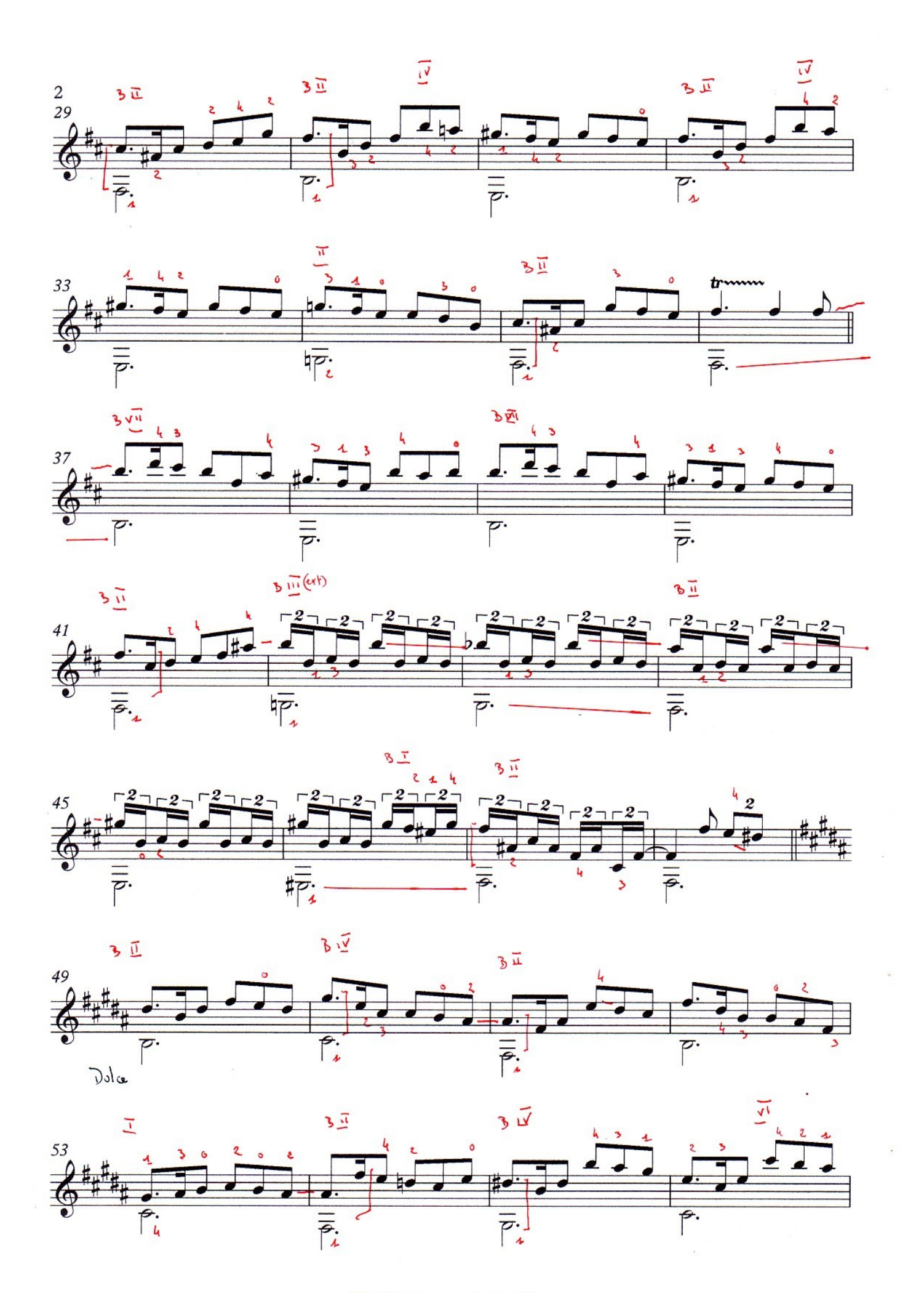
N° 176 - La morrina - p 02 -