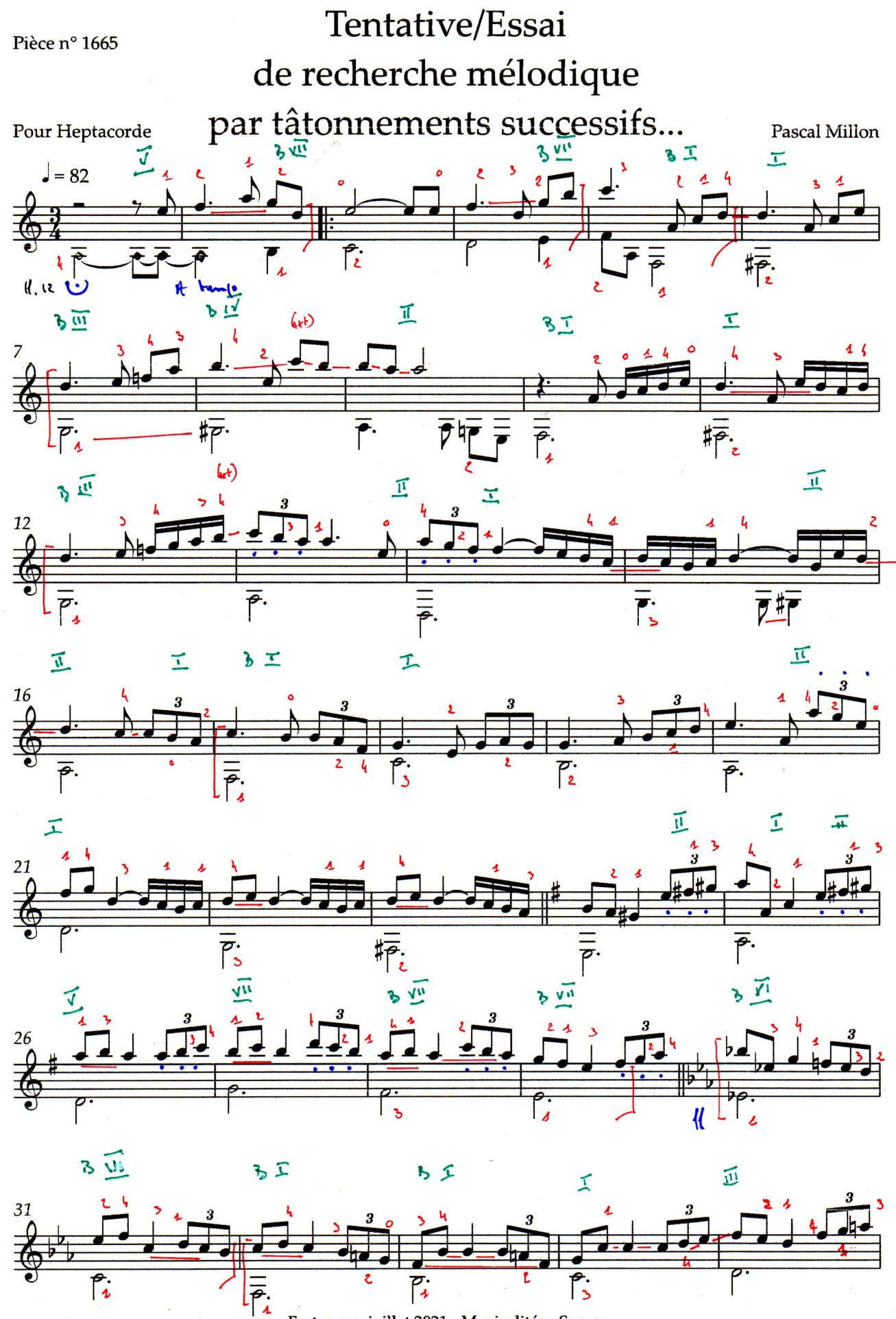
Fratanges, juillet 2021 - Musicalités - Sacem