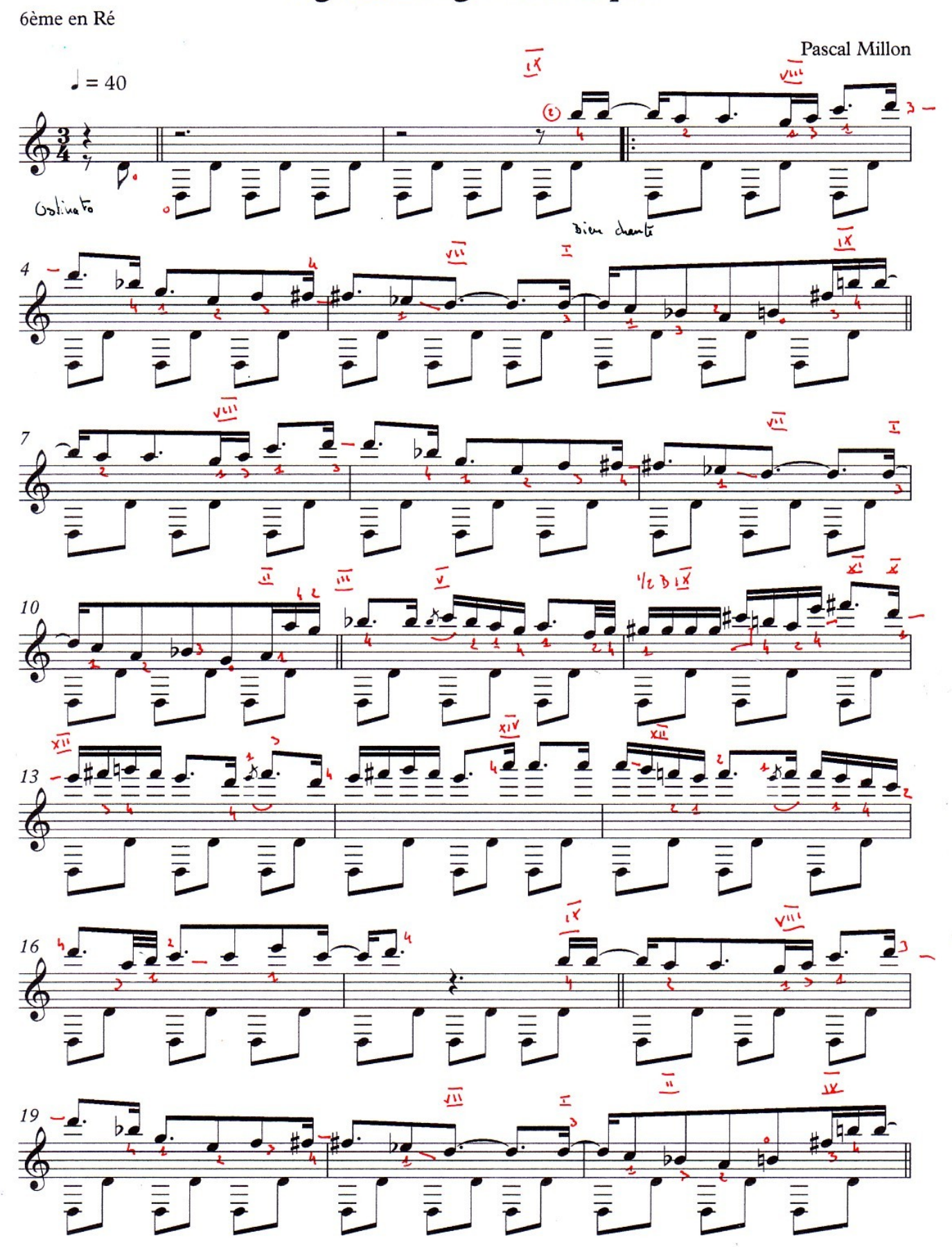
Woustviller, juin 1994 - Musicalités - Sacem