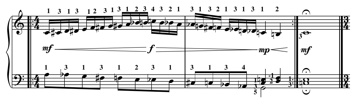
2) Syncopes :