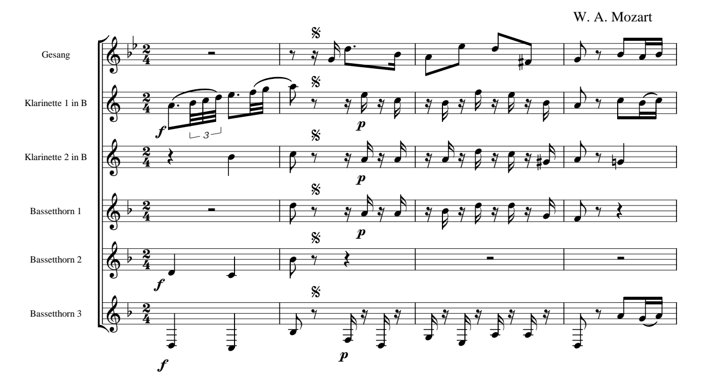
Lied für eine Singstimme mit Klavierbegleitung arr. für Singstimme mit 2 Klarinetten und 3 Bassetthörnern von Thomas Graß