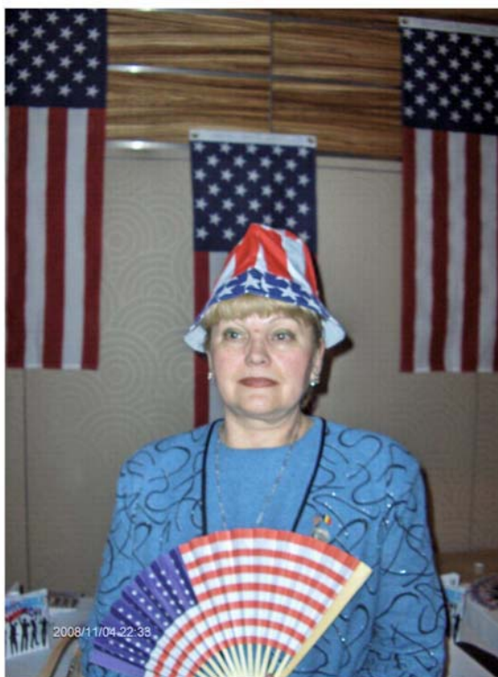
USA Elections, November 4, 2008