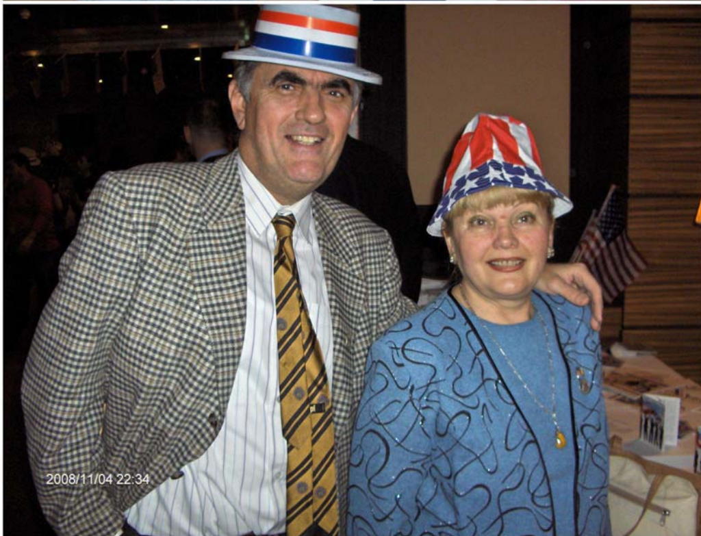
USA Elections, November 4, 2008