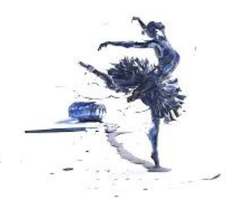
3ème Gymnopédie (1888)