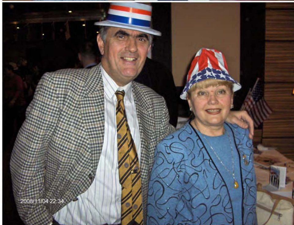
USA Elections, November 4, 2008