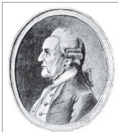
Wilhelm Friedemann Bach