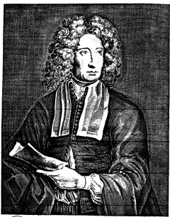
ARCANGELO CORELLI 1653-1713