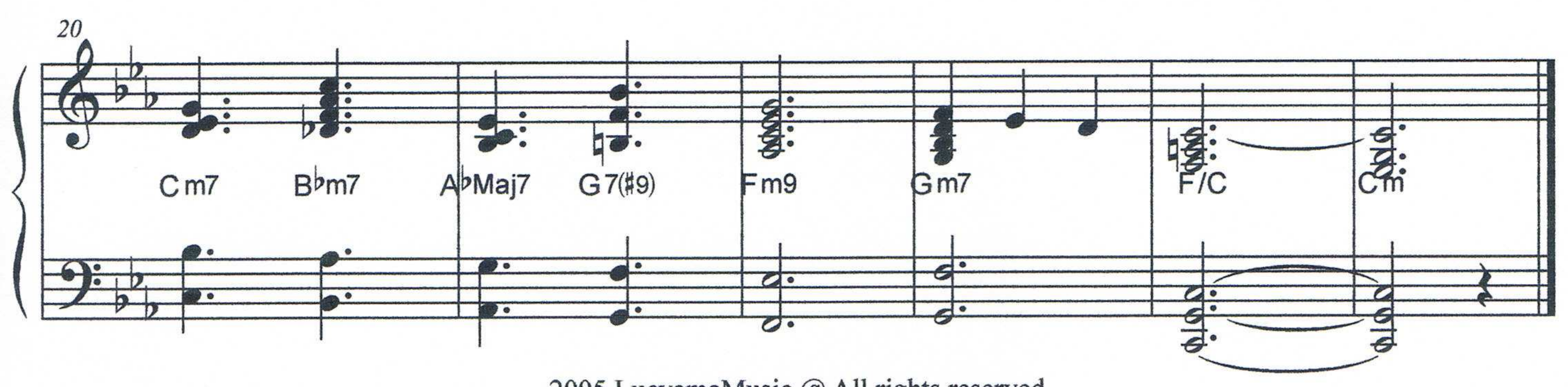
2005 LucyamaMusic @ All rights reserved